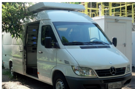
Example of mobile air quality monitoring station with rack version 2M series analyzers.

TCP/IP remote control with dynamic, multilingual interface, featuring intuitive navigation by pictograms.