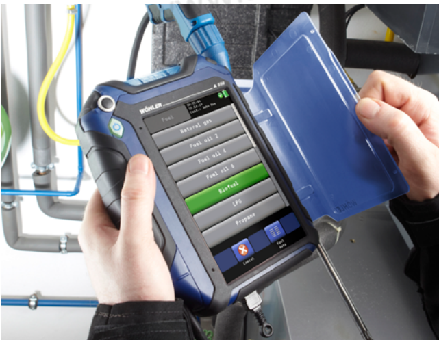
Robust and wear-resistant by design The Wöhler A 550 Flue Gas Analyzer with protective hinged lid.