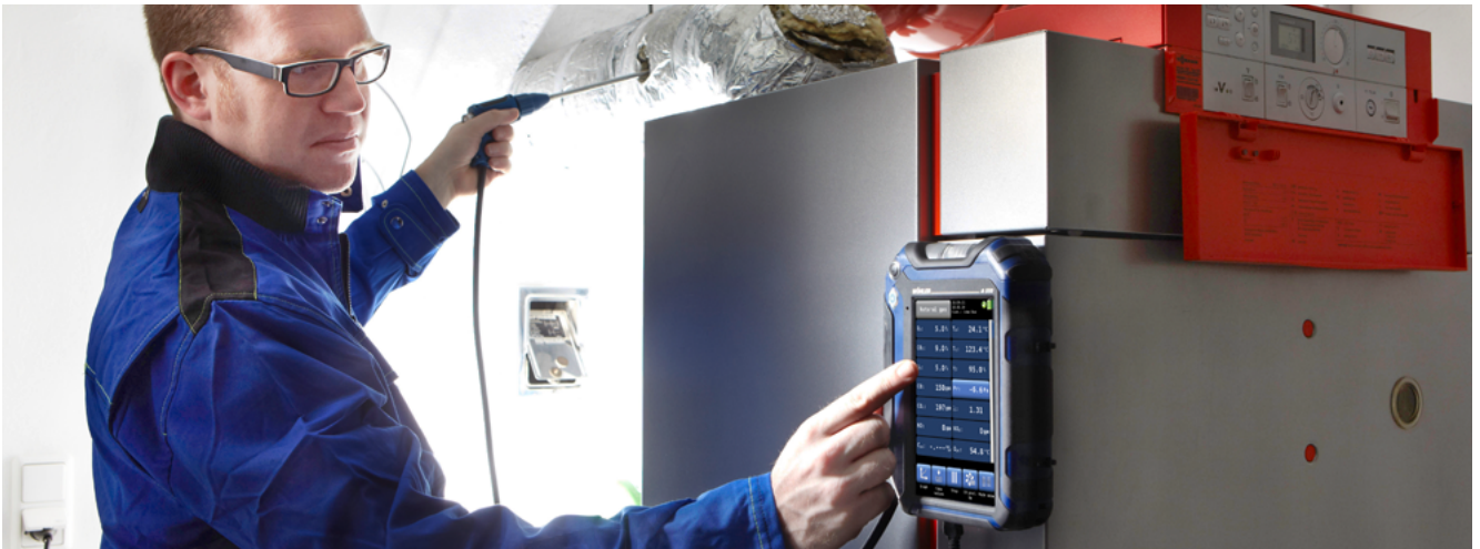
Easy to use with a clear design The Wöhler A 550 offers you the highest level of working convenience.