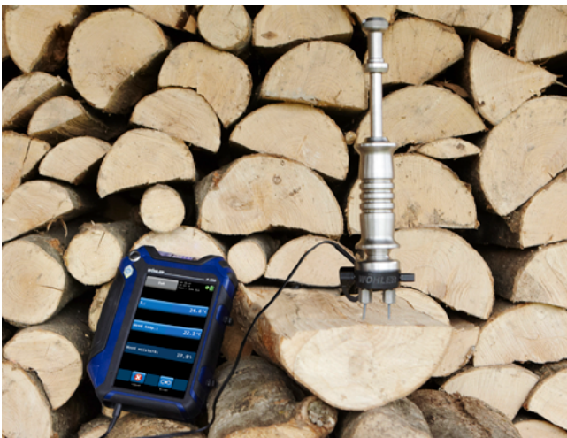
Wood Moisture Measurement Optional probe available for wood moisture measurement.