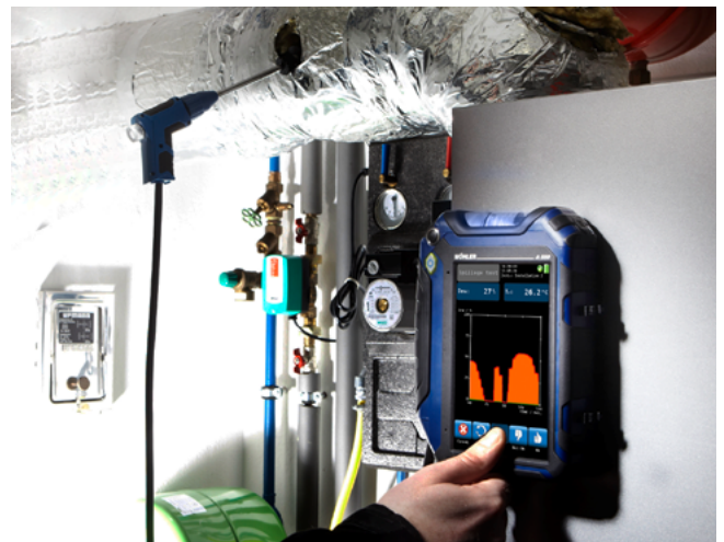
Spillage Test Optional probe available to test for back-draught conditions in the chimney.